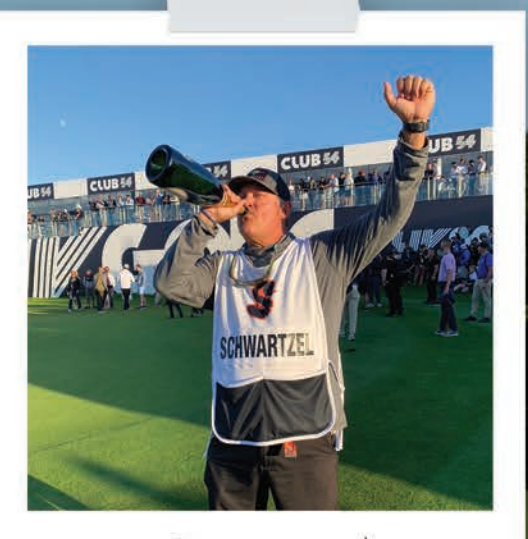
Time to celebratel